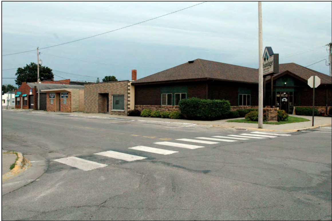
View of the west side of the 100 block of W. 3 rd St. N., looking southwest. The resource is indicated.