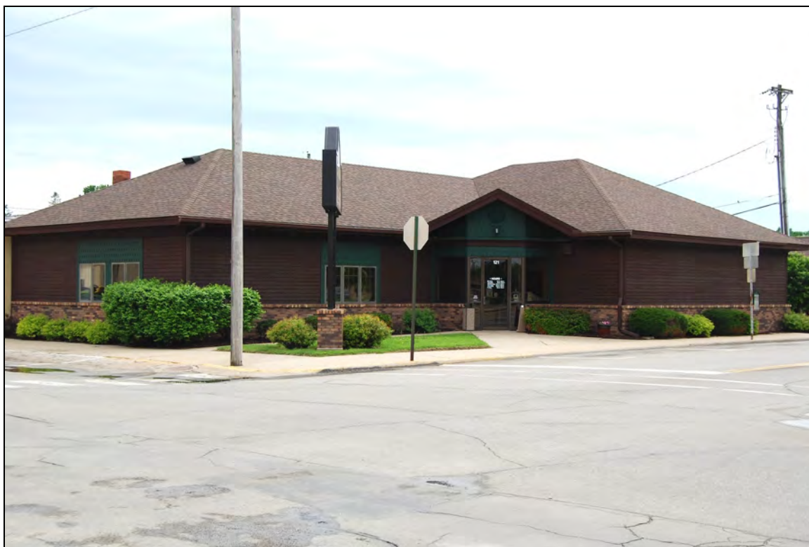
Looking southwest from the corner of West Third St. N. and N. 2 nd Ave. W.