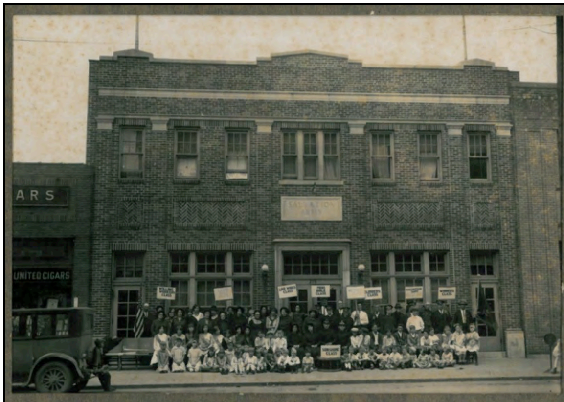
Looking south across N. 2 nd Ave. W., this photo from the middle 1930s shows the Salvation Army's Sunday School classes in front of the building. Today, the building's front façade retains much of its original historic appearance.