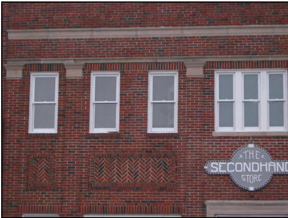
The photo shows detail of the brickwork adorning the front façade.