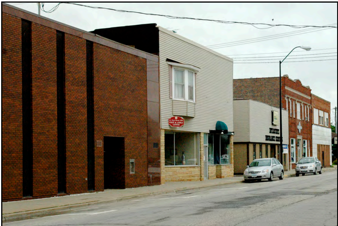
Looking southwest across N. 2 nd Ave. W., the former Salvation Army building is indicated by an arrow.