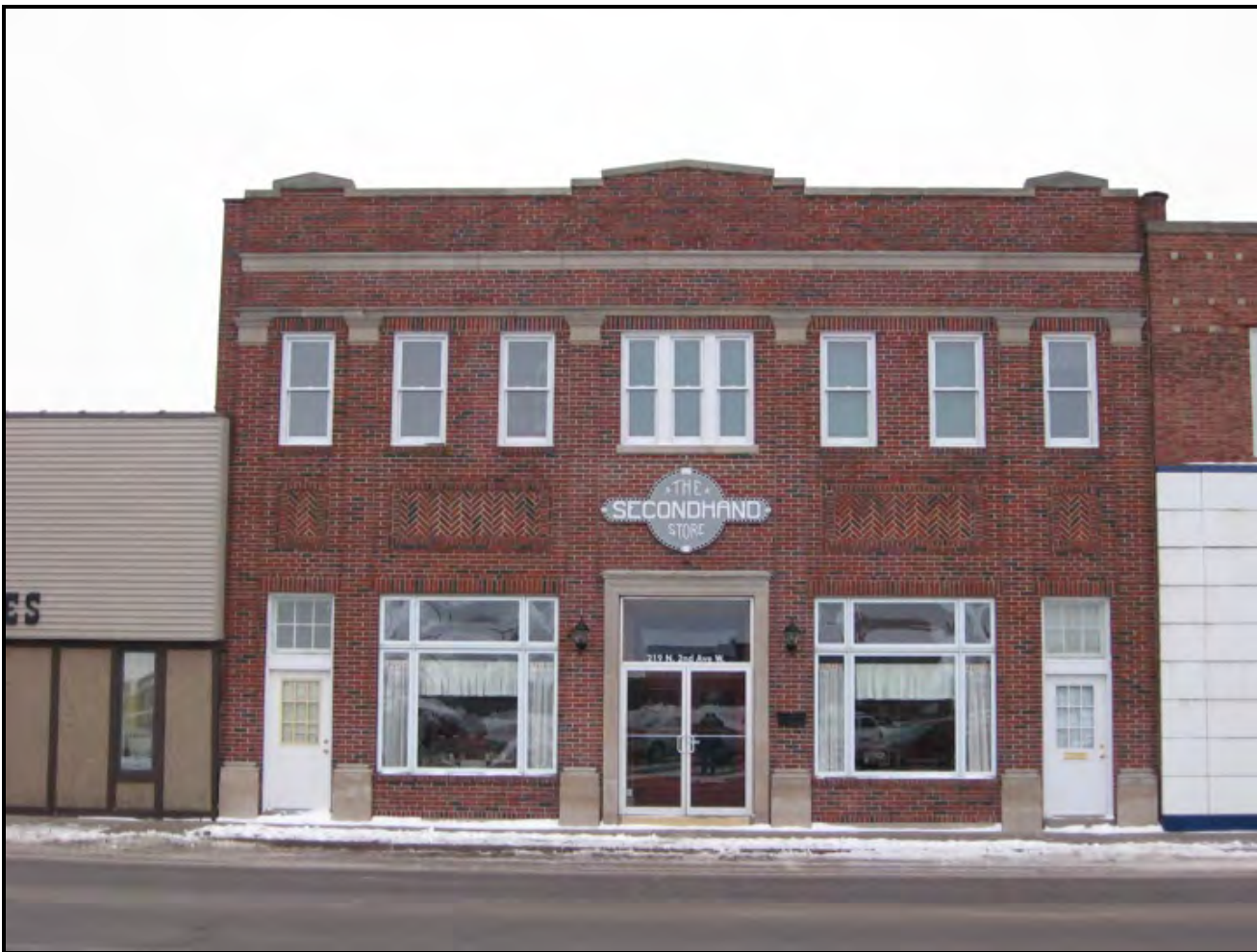
Looking south across N. 2 nd Ave. W. The building retains much of its original appearance, despite new windows and doors.