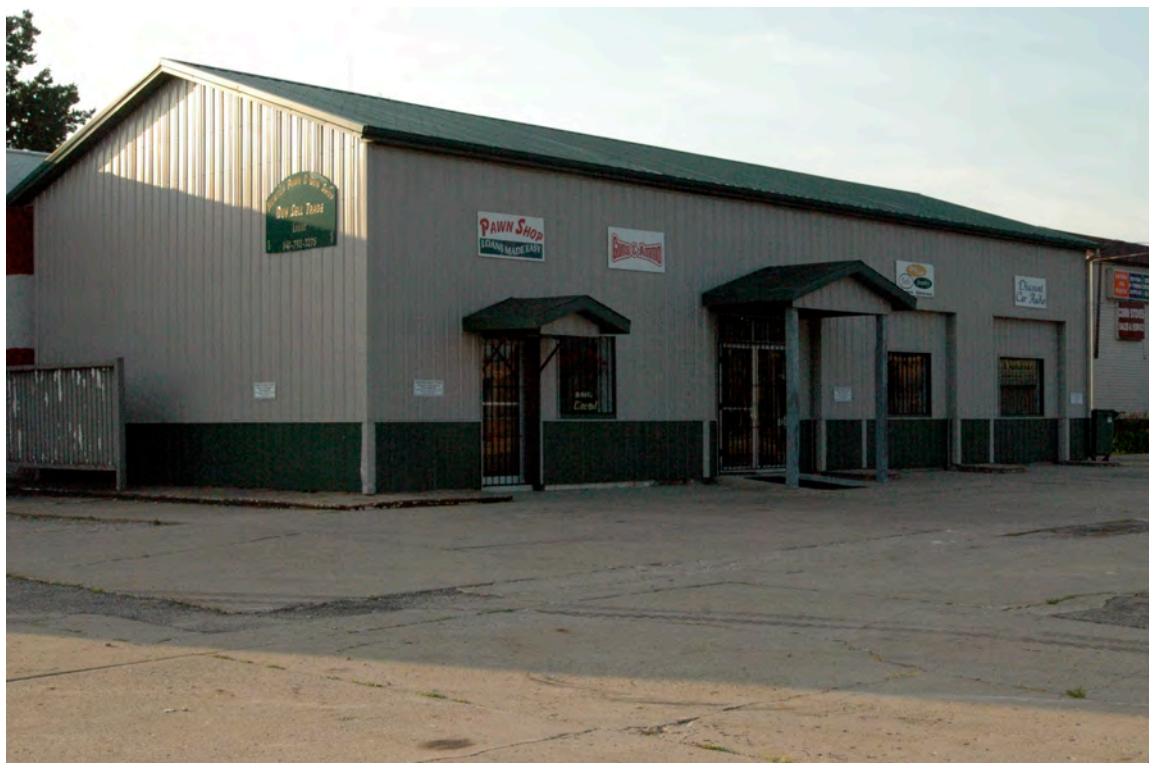
View of the resource, looking southeast from 1 st Ave. W and W. 4 th Street S.