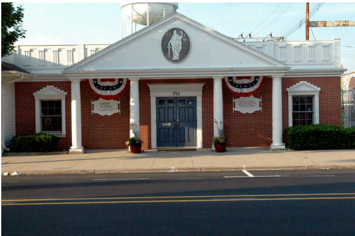
View of the resource looking south across 1 st Ave. W.