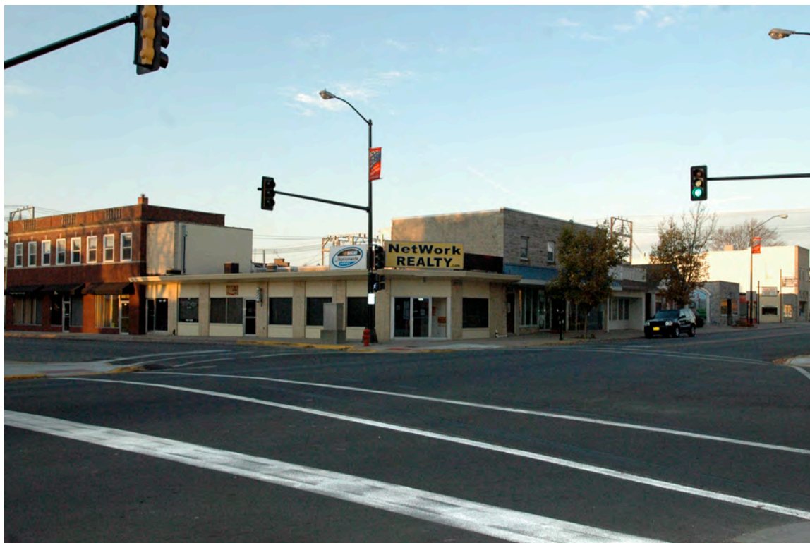
View of the resource (indicated) within the context of its streetscape - looking south across 1 st Ave. W. and 1 st Street.